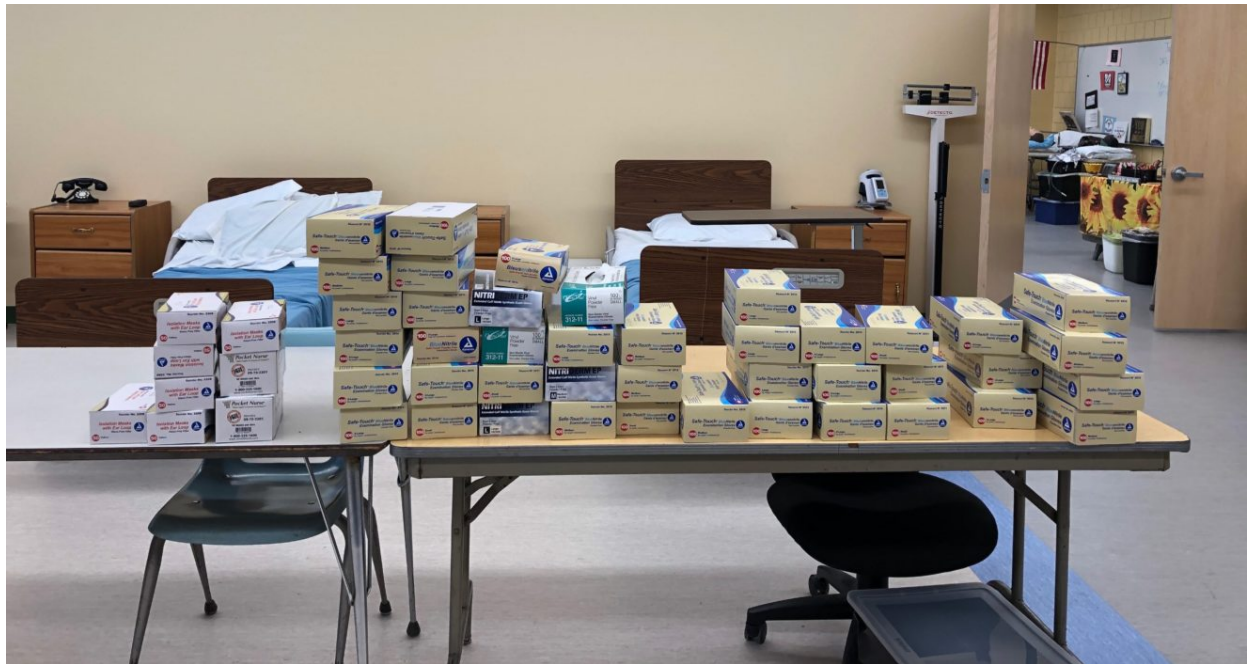
Blue Hills Regional Technical School donated a variety of health and medical supplies to area public safety and health agencies Saturday, March 21.